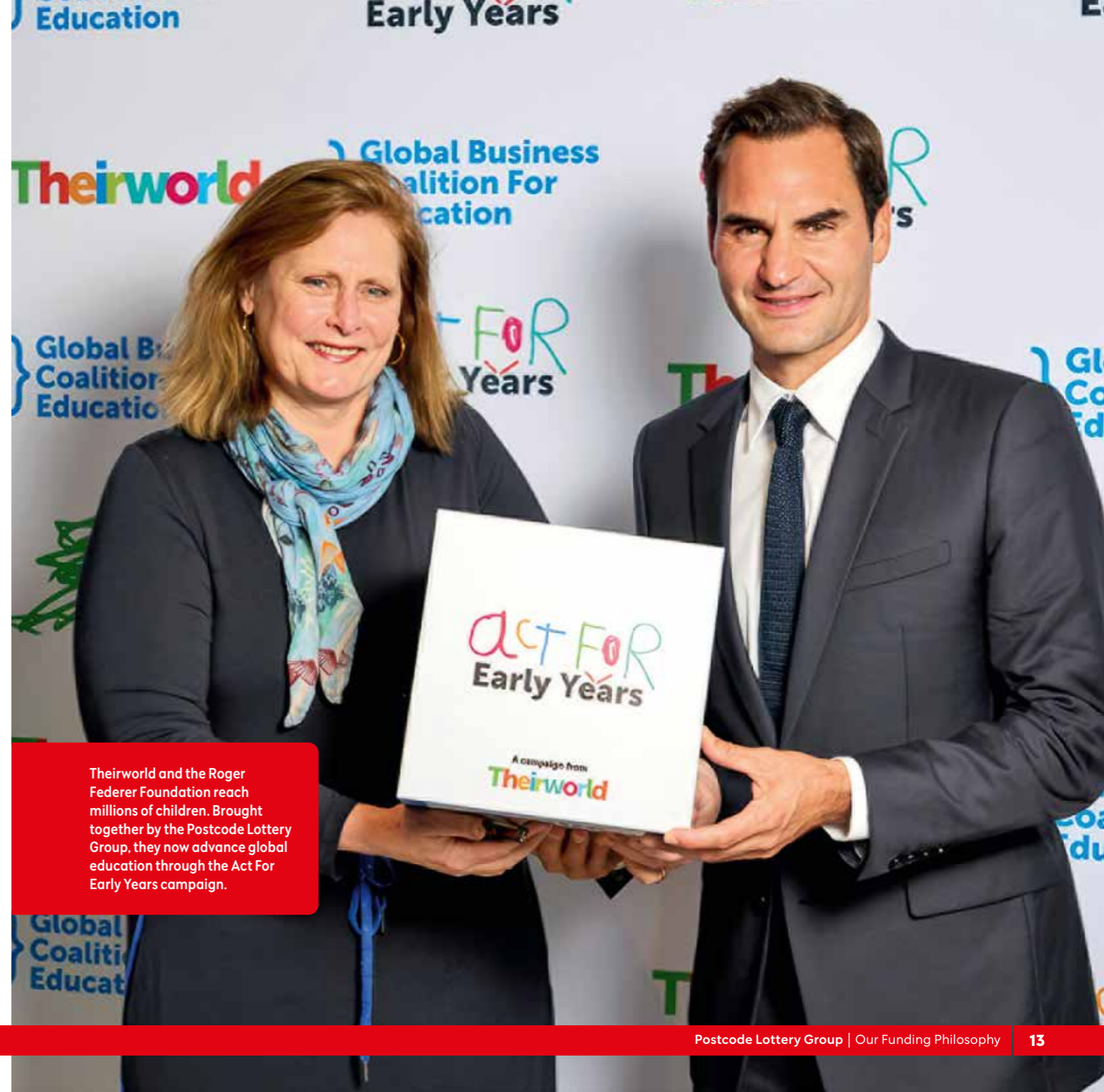
Theirworld and the Roger Federer Foundation reach millions of children. Brought together by the Postcode Lottery Group, they now advance global education through the Act For Early Years campaign.

The Postcode Lottery Group brings charities together, facilitating impactful collaborations aimed at tackling global and local issues. We go beyond funding: by providing informal opportunities for charities to connect for peer learning and support. We organise multiple events every year where our partners and leaders can meet and connect. We foster a network for collective action in which organisations join forces to maximise their reach and effectiveness. We encourage charities and good causes to collaborate and work together to develop and deliver impactful solutions.