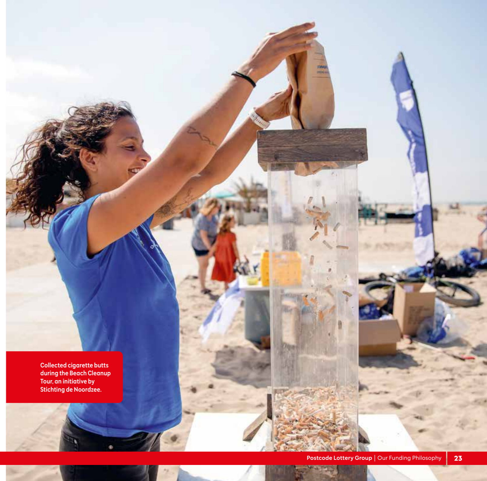
Collected cigarette butts during the Beach Cleanup Tour, an initiative by Stichting de Noordzee.

The councils focus entirely on the allocation of funds, evaluation of long-term partners, decisions regarding the extension of partnerships, evaluation of new long-term partners, one-time contributions, and addressing societal issues.