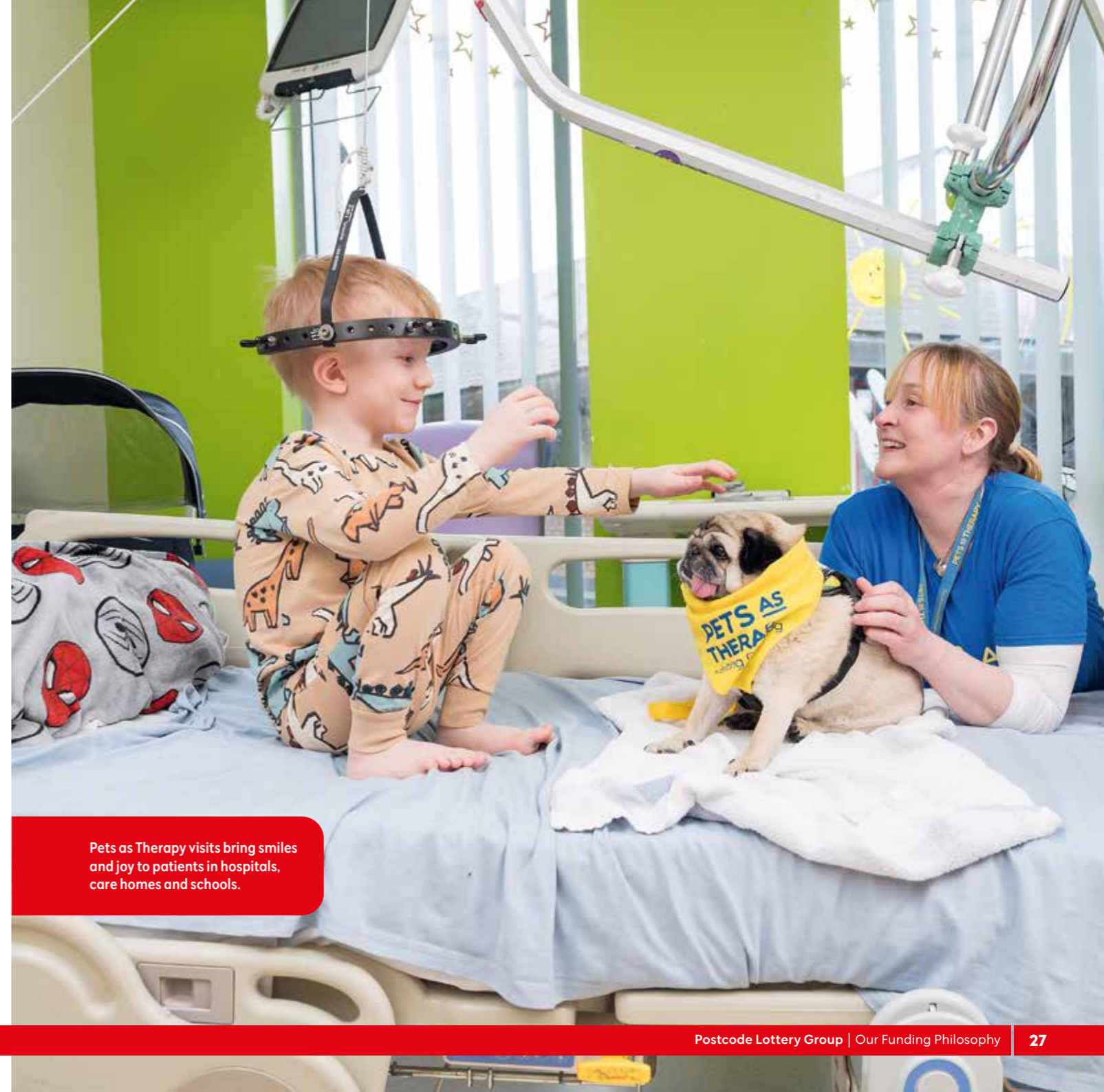
Pets as Therapy visits bring smiles and joy to patients in hospitals, care homes and schools.

Procedures to prevent and address problems effectively, taking the needs of all stakeholders into account, should be in place. In challenging times, it is vital to review the effectiveness of these procedures after they have been implemented. It is also crucial that the teams working for our charity partners, including their boards and supervisory boards, manage such situations effectively and take measures to learn, improve, and whenever possible, prevent any recurrence.