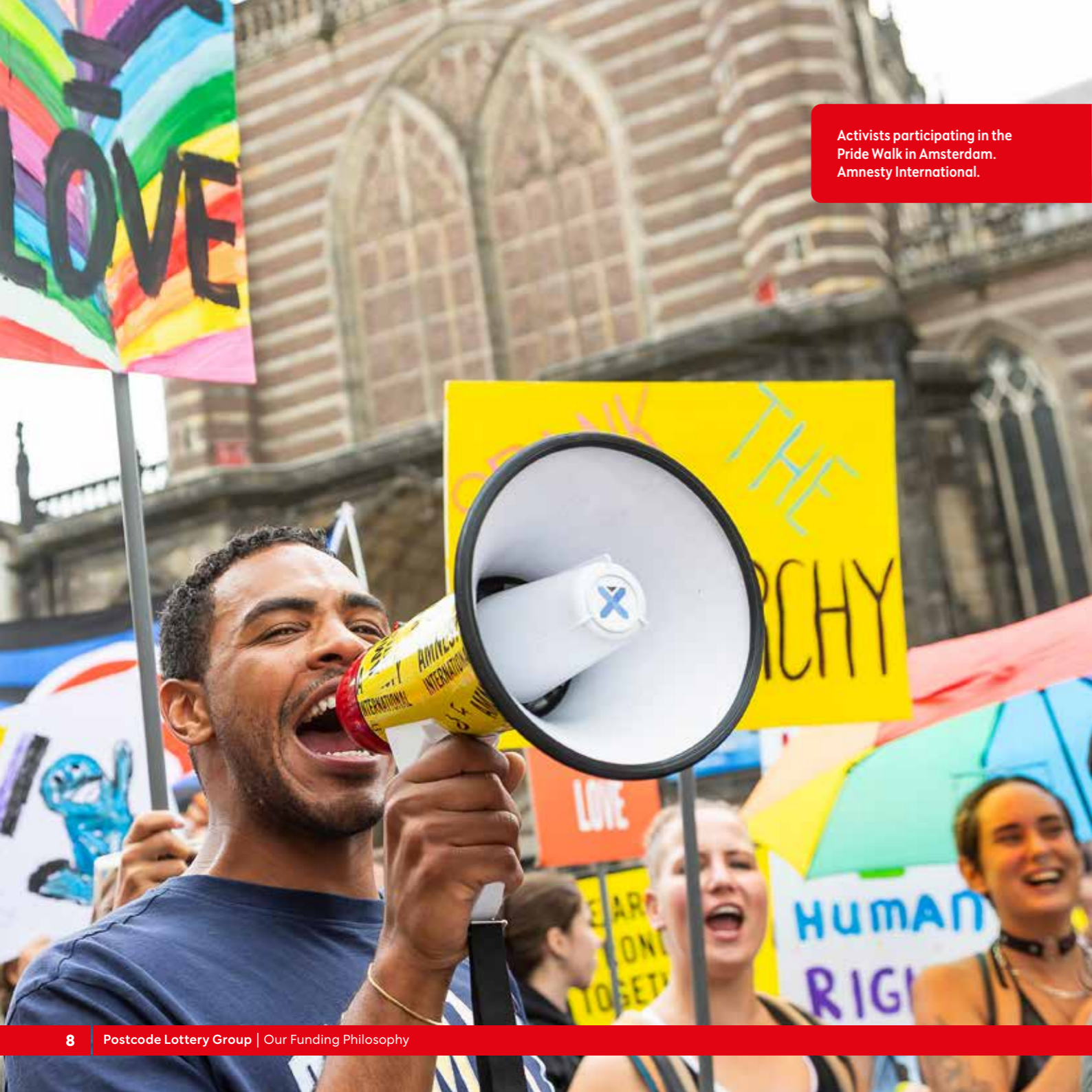
Activists participating in the Pride Walk in Amsterdam. Amnesty International.