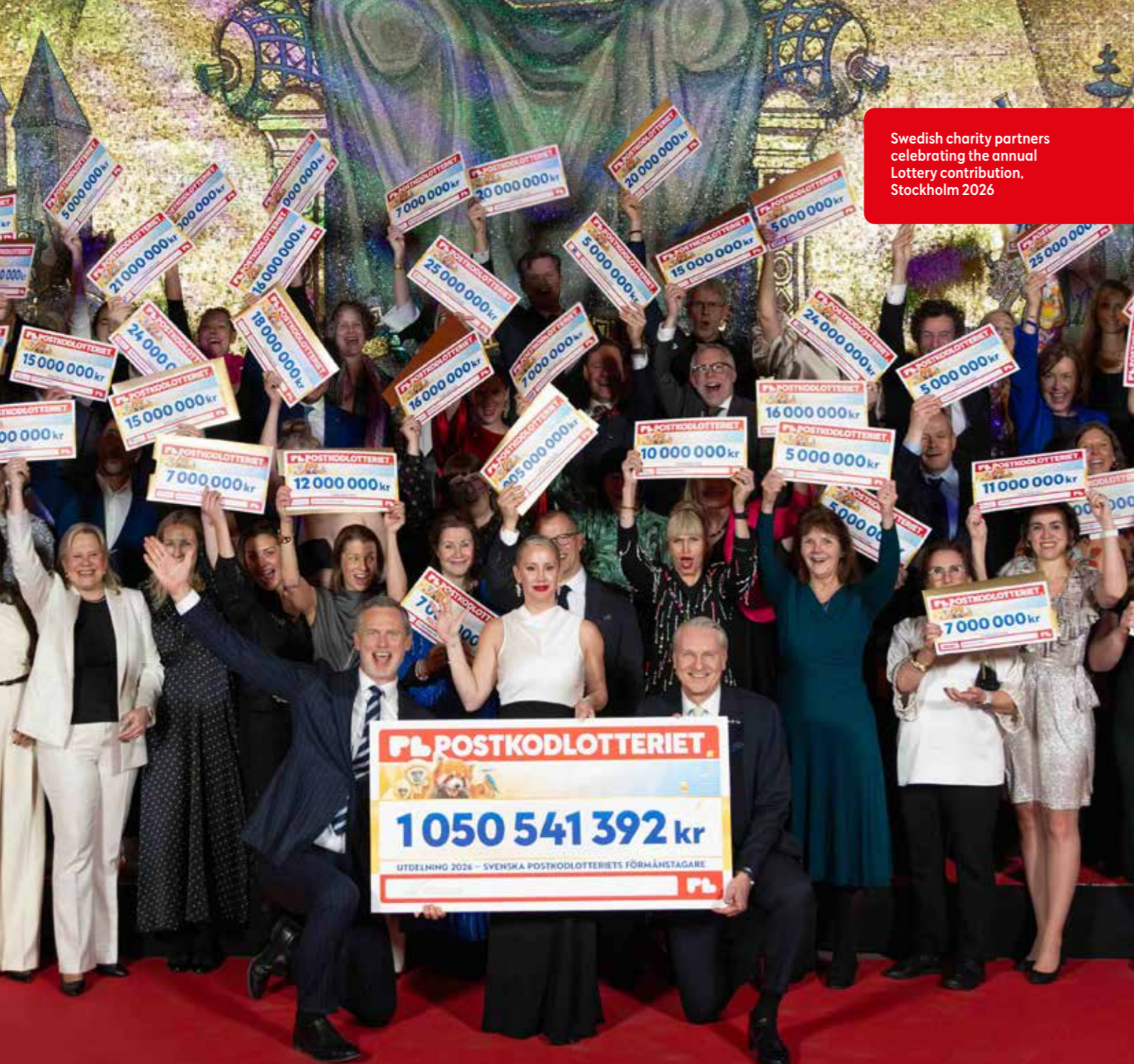
Swedish charity partners celebrating the annual Lottery contribution, Stockholm 2026