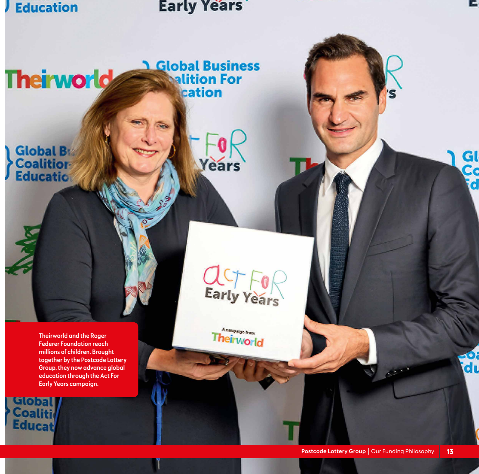
Theirworld and the Roger Federer Foundation reach millions of children. Brought together by the Postcode Lottery Group, they now advance global education through the Act For Early Years campaign.

The Postcode Lottery Group brings charities together, facilitating impactful collaborations aimed at tackling global and local issues. We go beyond funding: by providing informal opportunities for charities to connect for peer learning and support. We organise multiple events every year where our partners and leaders can meet and connect. We foster a network for collective action in which organisations join forces to maximise their reach and effectiveness. We encourage charities and good causes to collaborate and work together to develop and deliver impactful solutions.