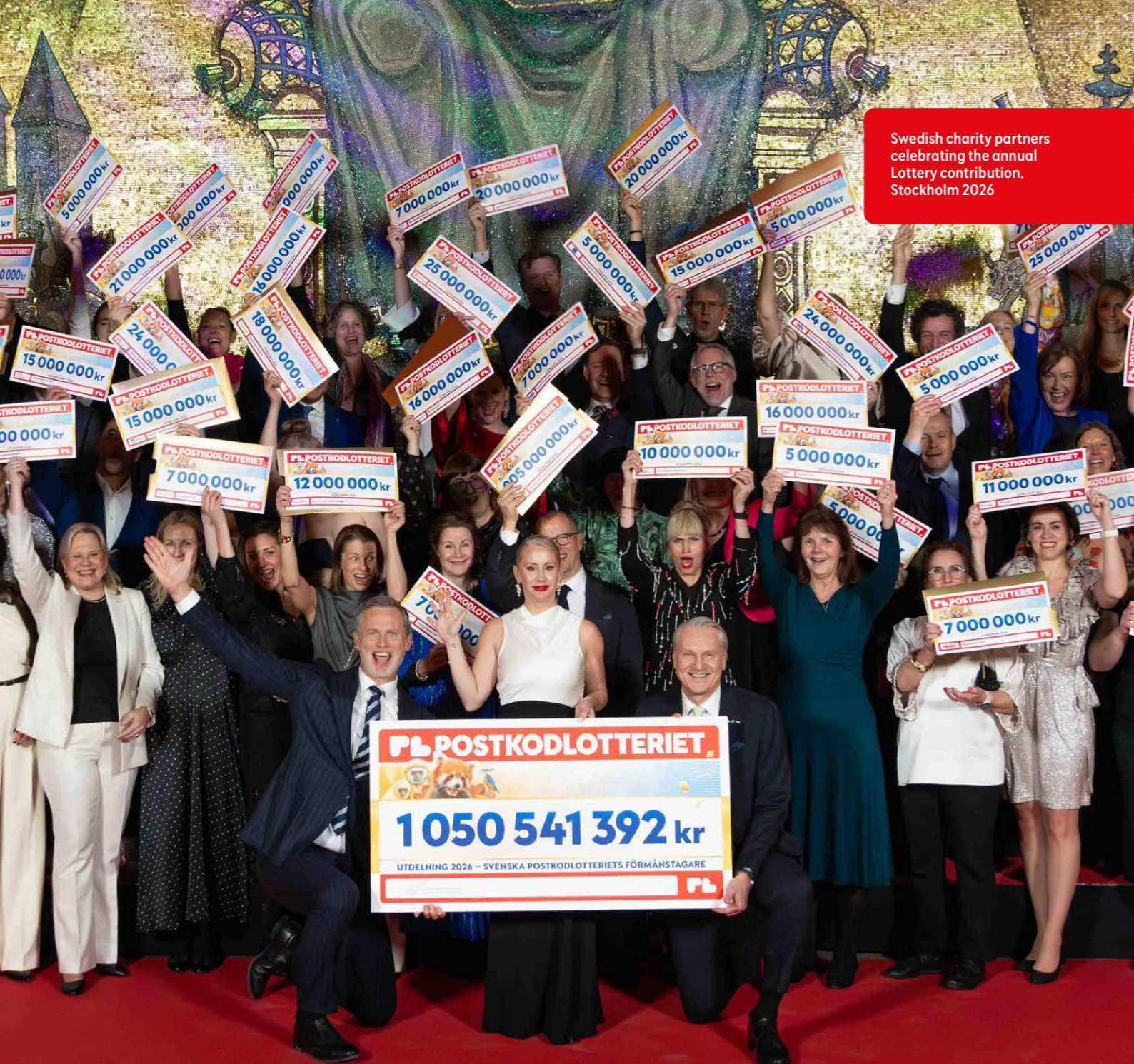
Swedish charity partners celebrating the annual Lottery contribution, Stockholm 2026