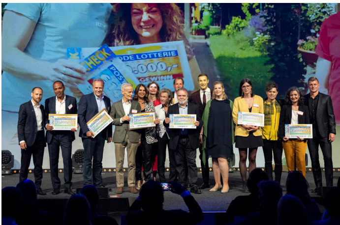
The first seven long-term charity partners were announced on the Charity Gala in Düsseldorf, June 2022. Greenpeace, WWF Germany, Doctors Without Borders, SOS Children's Villages, Amnesty International, UN Refugee Aid and Sea-Watch received a total of €12 million.

The German Postcode Lottery had a brilliant year, reaching 1.4 million subscriptions in December. The Lottery has realised a revenue of more than €200 million this year benefitting over 3,300 initiatives across Germany.