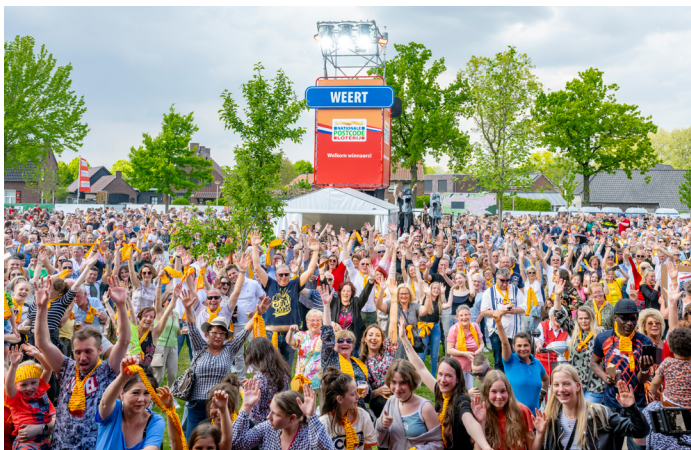
The community of Weert, the Netherlands, celebrates the KoningsKanjel of €36.7 million in May 2022.

The number of clients of Food Banks in the Netherlands has increased by more than 20%, including many single elderly people. Therefore, its multi-year contribution has been increased to €900,000 a year.