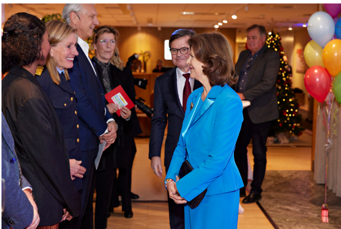
Her Majesty Queen Silvia of Sweden visits the Swedish Postcode Lottery office in December 2022.

The Swedish Postcode Lottery is well on its way to reach 1 million players and has donated SEK 13.5 billion to charities since 2005. November became a winning month, when the Swedish Parliament finally decided that charity lotteries also in the future should be guaranteed a special position on the Swedish gambling market.