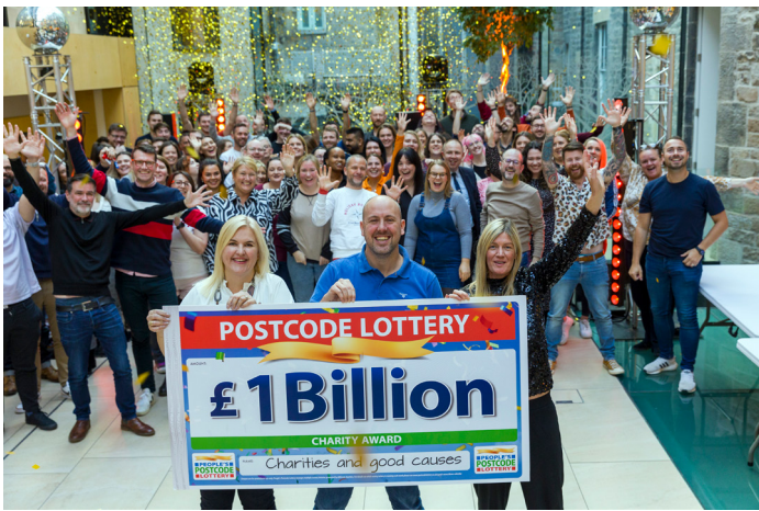
Team members in the office in Edinburgh, celebrating the milestone of £1 billion in total funds raised for charity in November 2022.

People's Postcode Lottery players raise close to £16 million every single month for charity. Money which is helping transform lives and communities at a time when it's needed most.